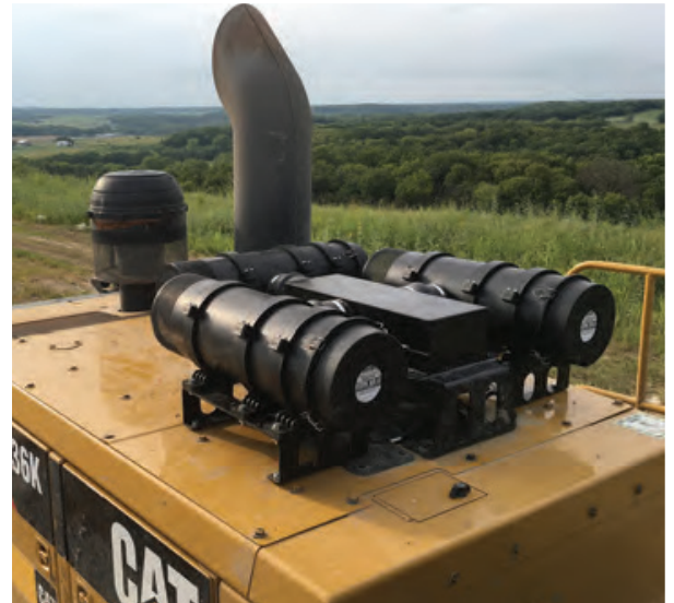
Filter life increased from an average of 29 to 500+ hours

“Sy-Klone really knows what they are doing with engine-precleaning. The XLRs work very well to separate the debris out of the airflow. The inlet screen does not plug and all we do is just change the OEM filter as required. I am impressed with how well these work.”