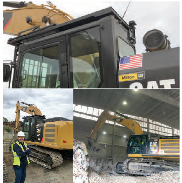
Estimated Annual Saving on 950 M: $20 285*

This may not be a stock item. Please speak to our sales representative about lead times. Lead times, price and availability can only be determined on receipt of an official quote from our supplier. This can sometimes take up to 3 days.