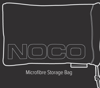
Microfibre Storage Bag