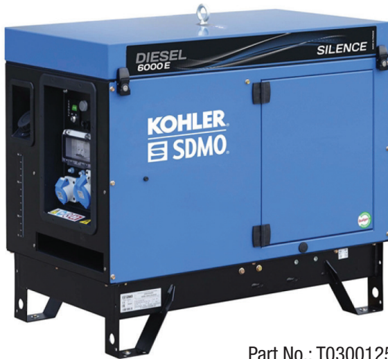
Part No.: T030012504