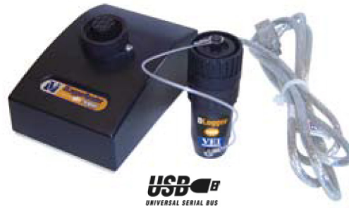
DLogger Memory Stick and USB Reader