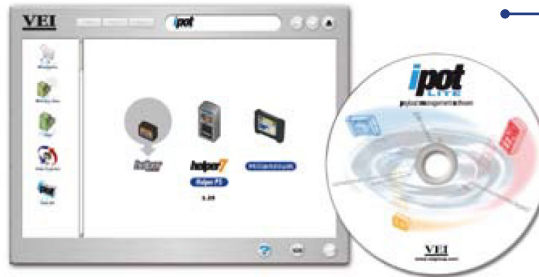
ipot Lite payload management software