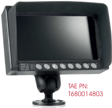
7" (178 mm) RLED Monitor Serial R6

Machines are increasingly becoming further advanced with elevated demands on efficiency and output. Still, it is people that are required to handle this equipment correctly. Operators have minimal vision around the vehicle. It is essential to solve large blind spots in a professional manner. This is where Orlaco's camera monitor solutions will help to improve operational efficiency and safety.